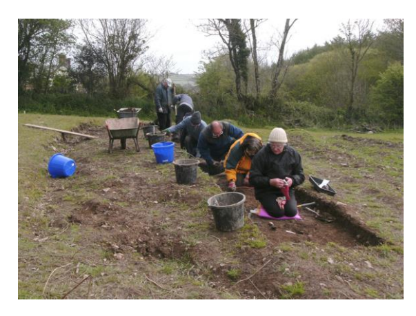
Happy diggers at Little Potheridge

Just for your interest and information therefore, here are a few details of what we know at present.