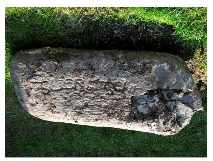
The West Down inscribed stone with name 'GUERNGEN'.

emergence of Anglo-Saxon England. Both in south and west Wales and in the southwestern peninsula of England, stones bearing inscriptions - principally in Latin – and dating from the 5<sup>th</sup> to 8<sup>th</sup> century have been known and studied for some time. In the South West, Cornwall has the lion's share, while the relatively few in Devon are distributed principally around Dartmoor and into the South Hams. Excluding four examples on Lundy, northern Devon has - or had only the CAVUDUS stone which stands in a garden in Lynton parish, while on Exmoor there is only the CARATACUS stone on Winsford Hill. The inscriptions