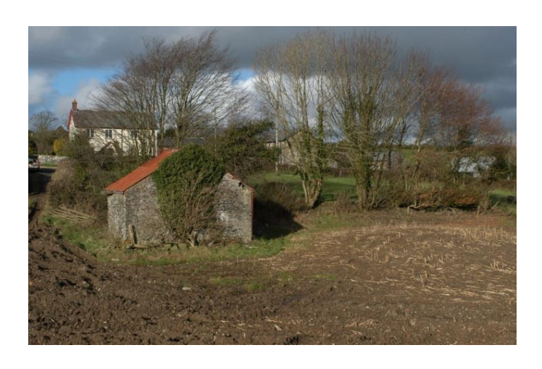
The possible kiln site

With the permission of the landowner Clinton Estates, and following on from geophysical survey, NDAS has a new excavation going at Little Potheridge near Merton (between Great Torrington and Hatherleigh) where there is artefactual and documentary evidence of clay-pipe manufacture in the 18<sup>th</sup> century and possibly earlier. The excavation of a clay-pipe kiln is a rare occurrence and the results could be nationally important. The excavation